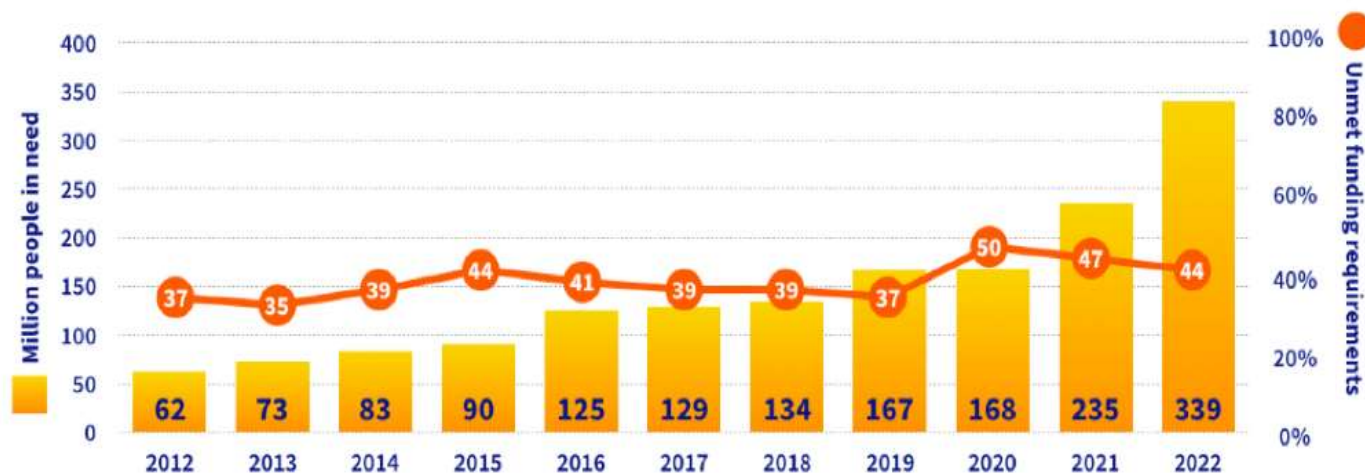
Increasing humanitarian needs and unmet funding requirements (2012 -2022)

Source: Global Humanitarian Overview / UN OCHA Financial Tracking Service, per Source Usage Year, as of 15 March 2023